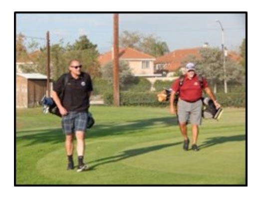
City Team Golfers