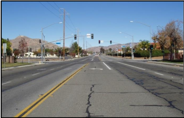
Before Construction - Frederick St.

The project was completed for the pavement resurfacing on Frederick Street, from Sunnymead Boulevard to Alessandro Boulevard, and Elsworth Street, from Alessandro Boulevard to Cactus Avenue, at the end of July 2016. The project enhances safety for commuters while extending the service life of the roadways. The project is funded by Total Road Improvement Program (TRIP) and Measure A.