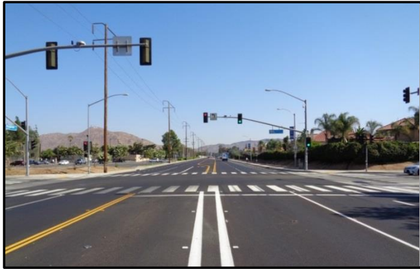
After Construction - Frederick St.