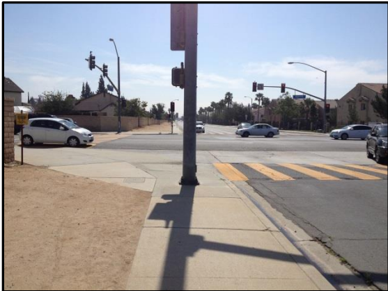
Northwest corner of Heacock-Cottonwood

GHD, Inc. is retained by the City as Design Consultant for the project. Design is anticipated to be completed by end of August 2016. Construction is scheduled to start in January 2017.