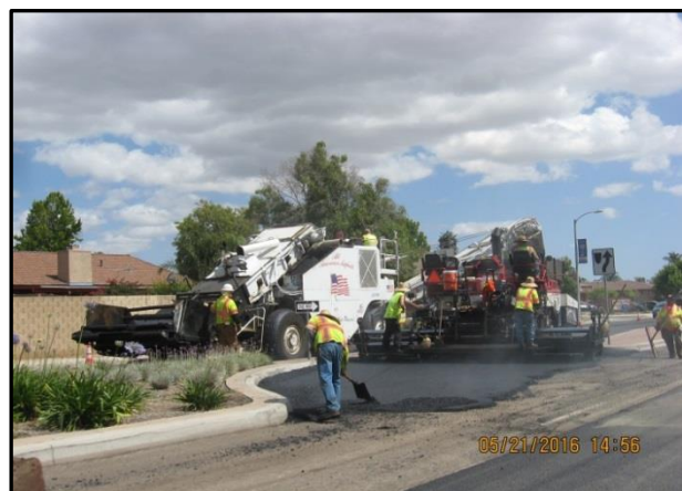
Paving on Frederick Street