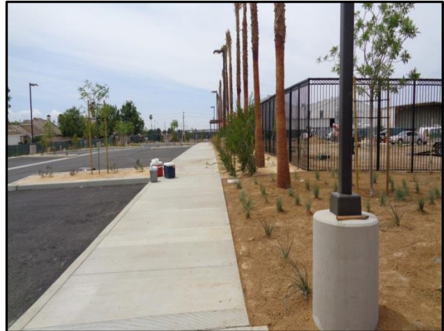
New parking lot