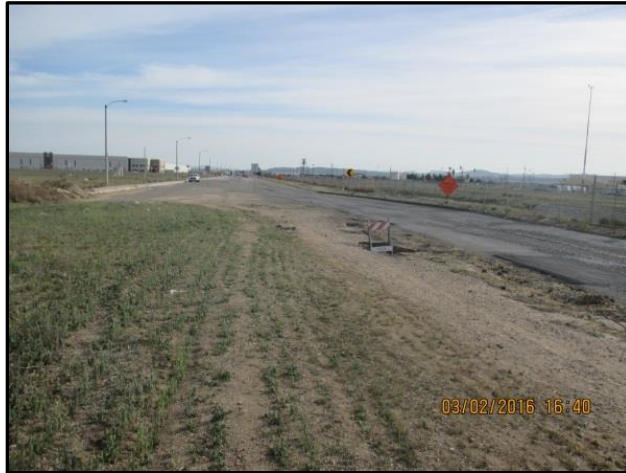
Heacock Street North of Revere

This project will realign and widen Heacock Street from Iris Avenue to Gentian Avenue. The improvement includes widening Heacock Street from 2 lanes to 4 lanes adding sidewalk, curb and gutter and resurfacing the roadway. The existing traffic signal at Heacock Street and Gentian Avenue intersection will be modified due to the new alignment. The construction is scheduled to start in November 2016 and completed by end of February 2017 (weather permitting).