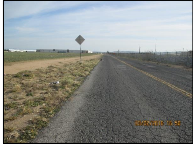
Heacock Street South of Gentian