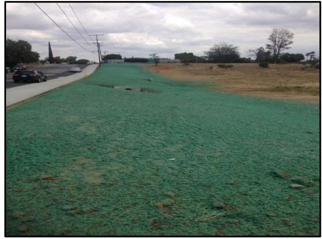
Sherman Ave. looking East from Day St.