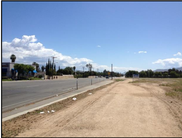
Alessandro West of Apple Blossom