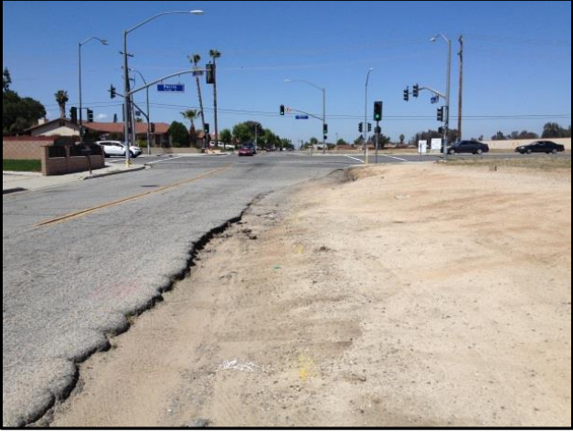
Brodiaea East of Perris