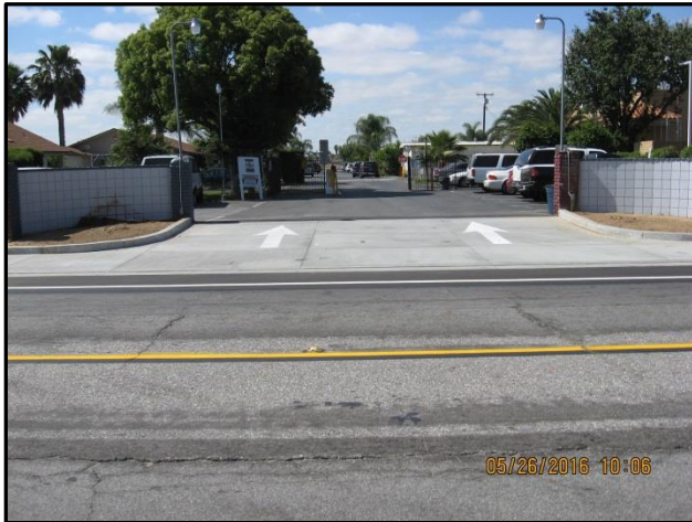
JFK Mobile Home Village entrance

Wheeler Paving has successfully completed the construction for this project. The work consisted of new sidewalk, new driveways, upgraded drainage, and reconstruction of the cross-gutters. The JFK Mobile Village entrance was rebuilt and the village will be making updates on their property as well. The project provided a continuous sidewalk on the south side of John F. Kennedy Drive from Heacock Street easterly to Paige Avenue by completing minor road widening and adding sidewalk. Construction was completed ahead of schedule.