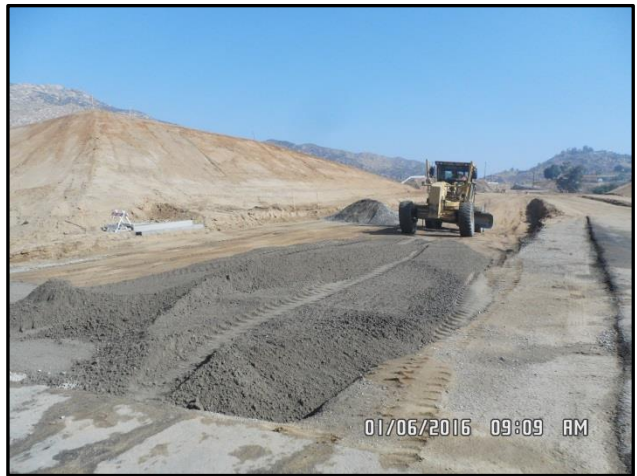
Grading at Reche Vista-Heacock