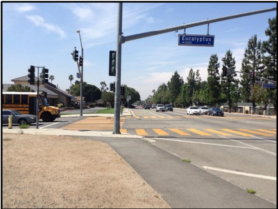
Northeast corner of Heacock and Eucalyptus