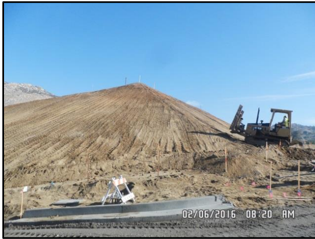
Soil Nail Wall installation