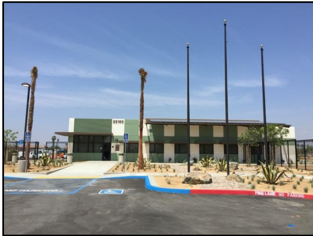
Front of new building

Keystone Builders, Inc. completed construction of the new Corporate Yard Administrative Building in June 2016. A Certificate of Occupancy was issued in July 2016 and the building is now occupied. The project was funded by Corporate Yard DIF funds.