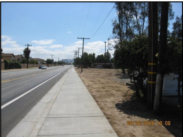
JFK looking East