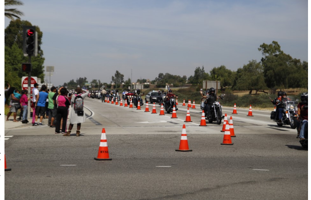
The Traffic Unit provided traffic control for over 8,000 motorcycle riders during the annual West Coast Thunder Memorial Day ride held on May 29, 2017.

The MVPD Traffic Team responded to 46 Minor-injury collisions, 145 Non-injury property damage only collisions, 5 Injury hit and run collisions, 68 Non-injury hit and run collisions, 0 major-injury collisions, and 1 fatality collision. In addition, the MVPD Traffic Team responded to 65 reckless driver calls, 30 traffic hazard calls, 66 abandoned vehicle calls, and 3 disabled vehicle calls.