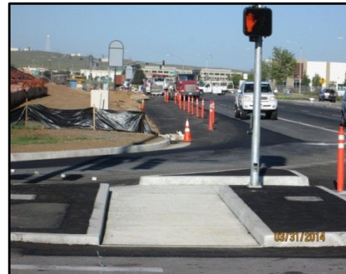
New widened lane from Elsworth Street west to Commerce Center Drive.