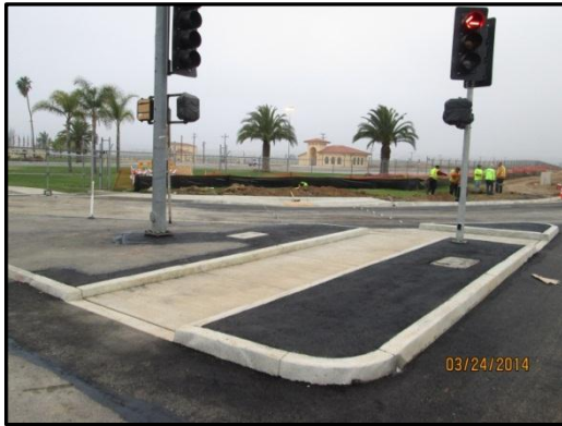
The reconstructed island and access ramps at the MARB main gate at Elsworth Street and Cactus Avenue intersection.

The main gate for March Air Reserve Base (MARB) located at Cactus Avenue and Elsworth Street is now open.